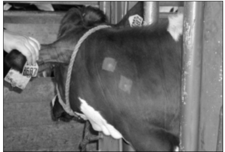
Animal with swelling at injection sites, exhibiting reactions to both avian and bovine PPD 72 hrs. following injection.

Cattle that are plotted in the reactor zone on the comparative cervical tuberculin test graph are classified as a bovine TB reactor. Cattle classified as reactors are subject to federal regulations overseeing reactor classification. These animals are quarantined to the premises where they are disclosed until a state or federal movement permit can be obtained. Within 15 days, the animals must be submitted to an appropriate animal diagnostic laboratory for necropsy and further diagnostic testing. Until diagnostic testing is completed, all cattle on the farm are quarantined.