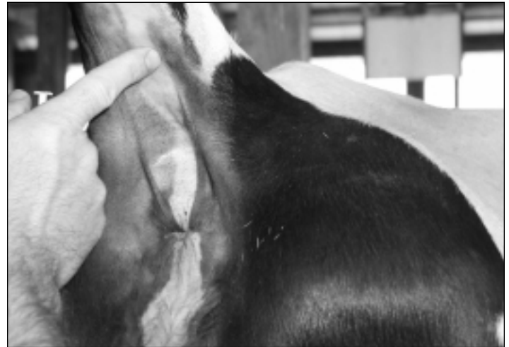
The caudal tail folds are two folds of skin located underneath the base of the tail.

(PPD) tuberculin (a bovine TB protein) within the layers of skin of the caudal tail fold using a very small needle. The caudal tail folds are two folds of skin located underneath the base of the tail. The test is "read" by the same veterinarian 72 hrs (+/- 6 hrs) after the tuberculin is administered. The injection site is inspected by both visual observation and palpation for indications that the animal has mounted an immune response to the PPD. If the animal's immune system recognizes the PPD, inflammatory cells (white blood cells) migrate to the injection site to help get rid of the foreign material (PPD). This is called a cell-mediated immune response. This response can be recognized by swelling or discoloration at the site where the PPD was injected. If any abnormalities such as discoloration or swelling are found at the injection site, the animal is classified as a CFT test responder (also known as suspect). This means the animal has